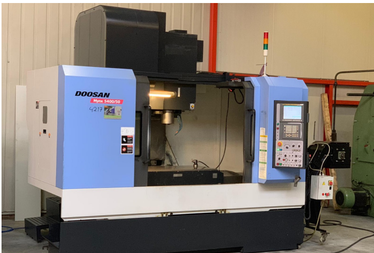
MYNX 5400 / 50